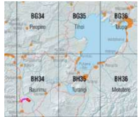
Access road mauve and tramp line red

The return walk, as shown on the map, basically follows degraded farm track round the southern and SW boundary of the farm with a steep descent ( WP07731masl ) down a grassy track through a slightly eroded muddy approach to a stream crossing ( WP08725masl ) – the stream crossing can be tricky in wet conditions as it turns into a torrent. In total time of around 2 hours there is a fence junction with gates ( WP09741masl ) where a turn to the right is taken. From here there are a few slightly steep grassy slopes to be ascended and descended. A fairly good spot for lunch can be found with a few dead trees for seats quite close to the (deer) fence ( WP10734masl ) after which it can prove more direct to follow the fence line until the road is stumbled over again, but some of the slopes are quite steep. The end is nigh when a gate is reached ( WP11698masl ) allowing access to the actual access road only a few hundred metres from the woolshed.