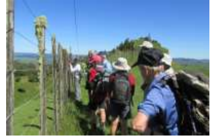
Pete's Pit Stop