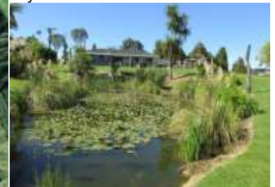
Pointed lunch meadow