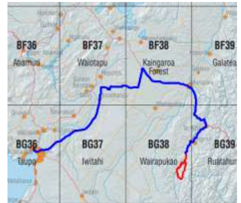
The road from Taupo through BF37 Waiotapu map sheet then SW through BF38 Kaingaroa Forest to Murupara and Minginui to River Road highlighted in BLUE RED = Tramp Route

Day 2 - The day starts with quite a pleasant stroll on good track down from the Mangamate Hut for 30 minutes to reach the Kakanui Stream ( WP11 591masl ). From here it is off-track heading west then north west in or following the stream line as it heads downstream - easier than fighting the current the day before working upstream in the Upper Mangamate. There is little to say about this section of the tramp apart from on a cold day it could be miserable, it is wet in anyone's language, the forest is great and it can be quite challenging to find suitable routes in the stream bed or on land around the odd gorge or dangerous looking parts of the stream. It should be noted that for long periods there is no or very poor GPS signal available due to the depth and narrowness of the valley which has dense forest coverage. Between 3 and 4 hours later the bush opens up a bit with lots of Punga and then the footbridge on the Whirinaki track ( WP12 513masl ) is reached and everything changes again.