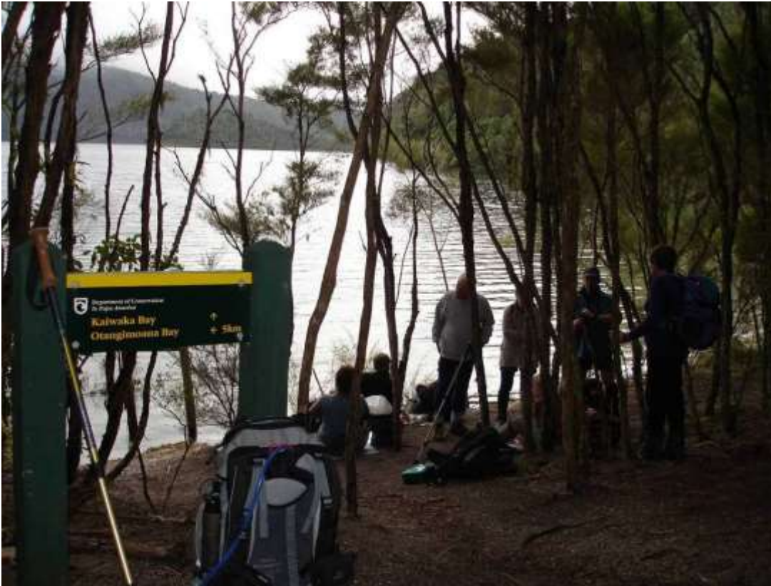
Millpond smooth lake reflections