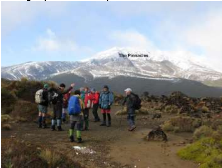
The target up behind the trampers