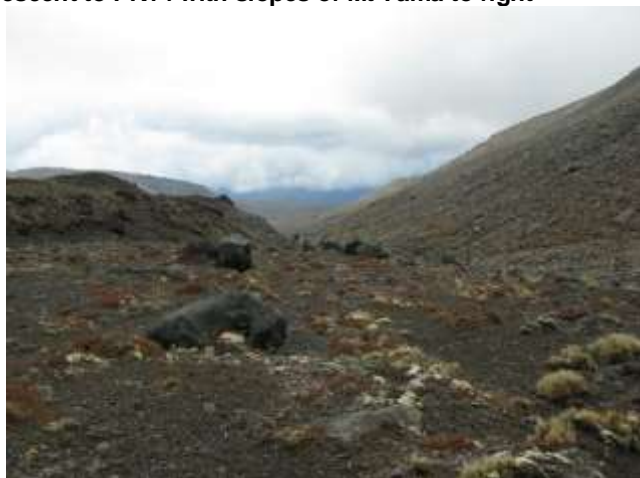
Descent to PK14 with slopes of Mt Tama to right