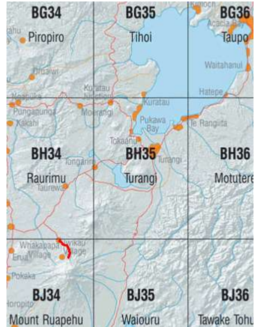
The map above shows the tramping route at the top part of sheet BJ34 whilst the access roads can be determined from the map