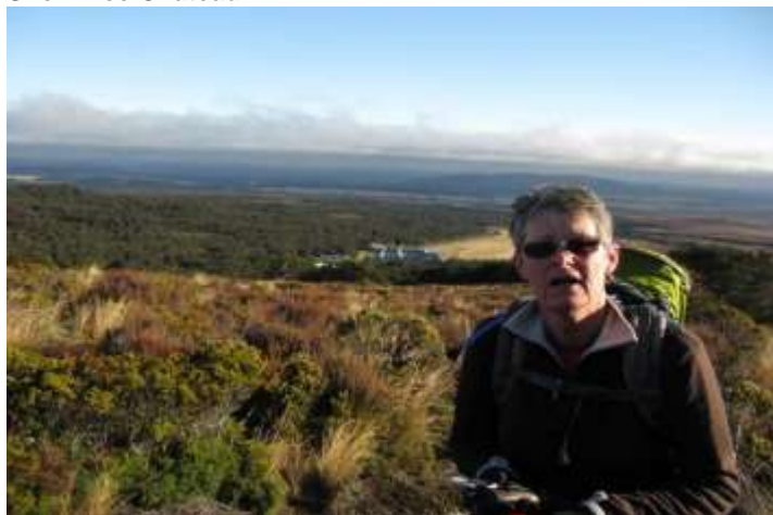
Snow free Chateau