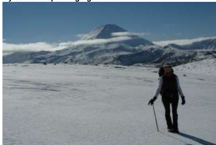
Icy cold and sparkling Ngauruhoe