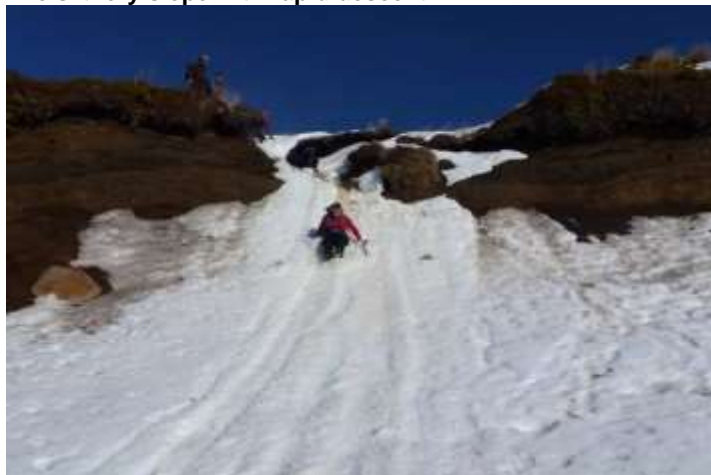
The slithery slope with rapid descent