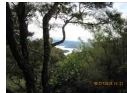
Glimpse of the lake