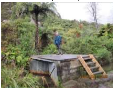
Fish trap box bridge