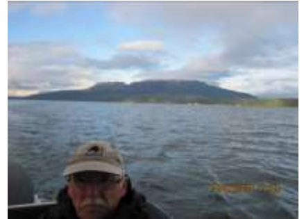
Tarawera from water taxi