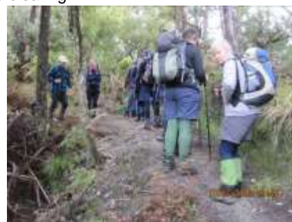
Narrow and eroded