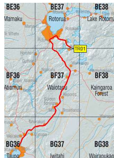
Access route in red with car park as TR01 in yellow

Within ten minutes a T-junction ( 03306masl ) is reached where the route turns to the left or NE close in below the bluffs on a track following the contour in an area dominated by tree ferns. Right possibly goes to the new carpark mentioned later. The shore line is quite closely followed for about 2km when some slopes start to appear ( 04308masl ) after crossing a mini-stream line. A rather flat promontory mainly with Kanuka – Karikaria Point – is crossed ( 05309masl ) where a mapped stream was never seen.