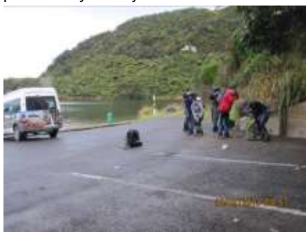
Car park at Punaromia Beach