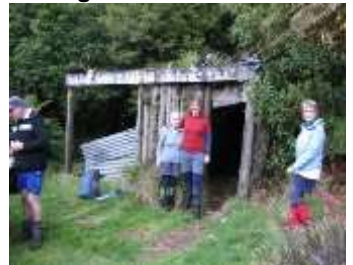
Even Hobbits duck