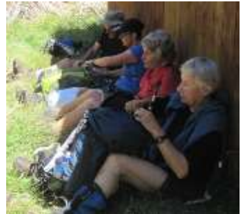
The Ngamuwahine Shelter