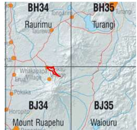
Vegetated cap edge

The view ahead once down off the ridge is rocky to the left and open sandy fans to the right towards the bluffs and mountain with the preferred walking line aiming just to miss an upstanding rocky sentinel ( WP10 1453masl ) on the extreme SW edge of the rocky area. It is soft walking through this area – a bit like walking in soft snow – with just over 500m to the base of the cone ( WP11 1477masl ).