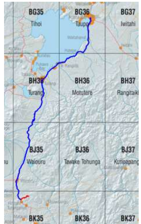
The road route can be seen as the BLUE line whilst the tramp route is the RED line.

Minutes after this there is a flat platform which must have been the site (WP13942masl) of the old Zeke's Hut – but where the water supply would have been was not obvious. A few hundred metres further on the new Zeke's Hut is found and, as stated earlier, this is a very new hut but it is mystifying as to why there is no proper covered deck (verandah) where wet trampers could dump wet gear then hang it up to dry.